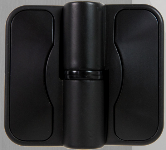
Satin Matte Black (DESIGNER)