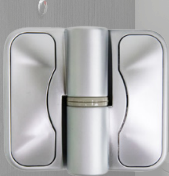
Satin Chrome Plate Finish (SCP)

Note: Not all Metlam Australia Toilet Partition Hardware (TPH) is available in all finishes listed above. Visit our website for further details on TPH products and available finishes.