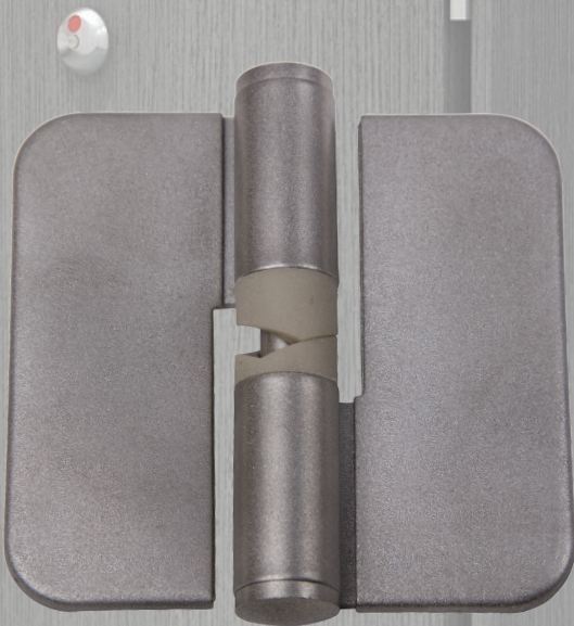
Sentinel Authentic Industrial Stainless Steel Finish